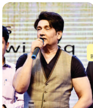
Shekhar Suman Bollywood Actor, Anchor & Singer