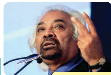
Live Conferencing with Mr. Sam Pitroda Telecom Engg., Entrepreneur & Former Advisor to Prime Minister on PIII