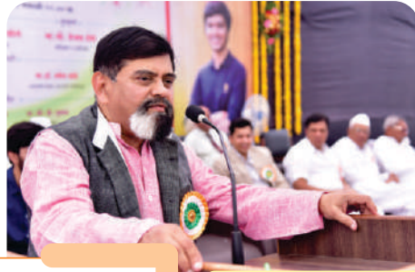
Mr. Achyut Godbole Marathi & English Writer