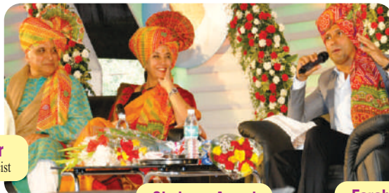
Javed Akthar Screenwriter & Lyricist