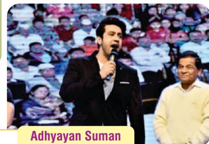
Adhyayan Suman Bollywood Actor & Singer