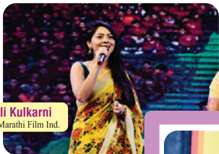
Sonali Kulkarni Actress, Marathi Film Ind.