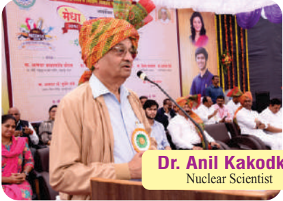
Dr. Anil Kakodkar Nuclear Scientist