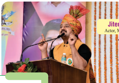
Jitendra Joshi Actor, Marathi Film Ind.