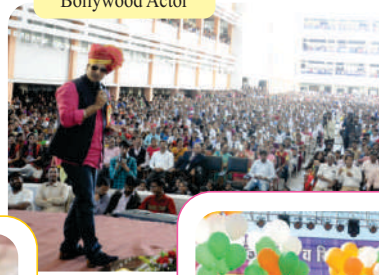
Vivek Oberai Bollywood Actor