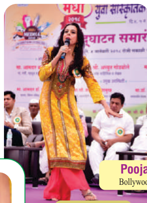
Pooja Bedi Bollywood Actress